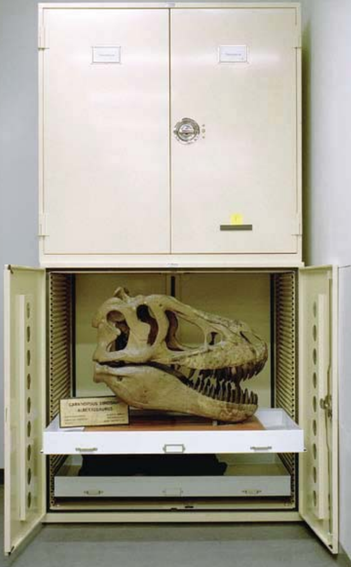
← Albertosaurus skull