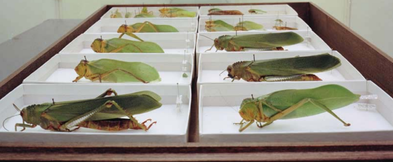
Katydid grasshoppers